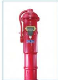
TAMPER SWITCH TYPE